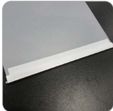
Take the re-enforcing tape and apply to the back of the banner and rail making sure there is even coverage between the two.