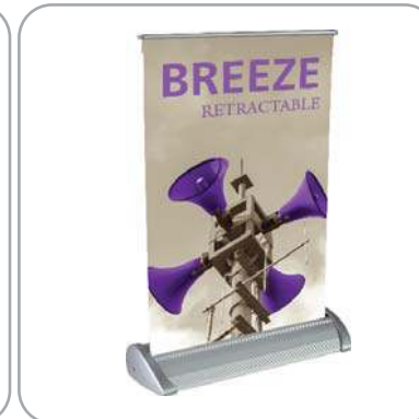
Unit is complete.