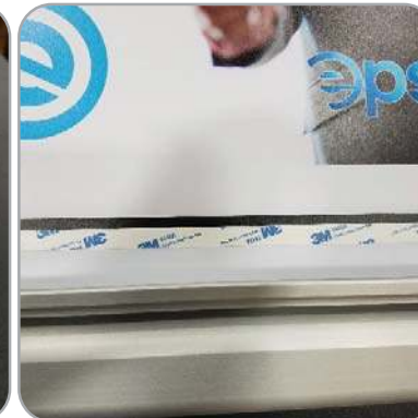
Line up graphic with leader strip.