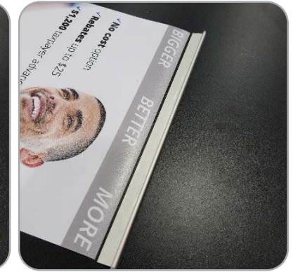
Apply graphic so that its even on both sides.