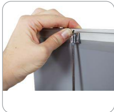
Pull up graphic and secure to poles.