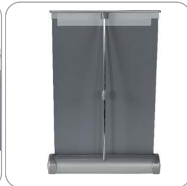
Unit is complete. Back view.