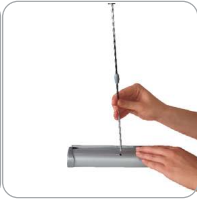
Secure pole to base of stand.