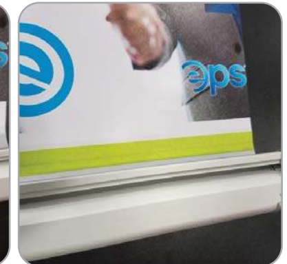
Apply tape to the bottom front of the graphic for extra re-enforcement.