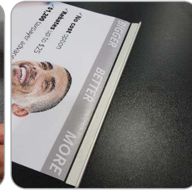
Line up graphic with rail.