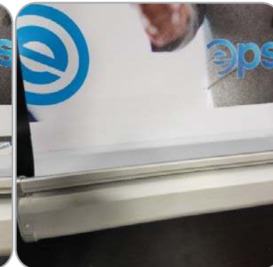
Mount graphic to leader strip evenly making sure there is one 1/2" of overlap.