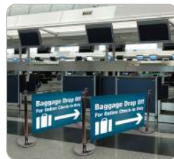
use to guide traffic