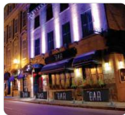
use for crowd control