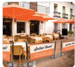
use as outdoor café barriers