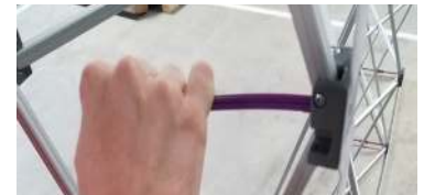
F2. Remove the female arm as in M2.; wiggle side to side and pull out to one side .