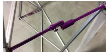
2. Insert the female arm into the frame hub.