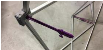
1. Insert the male arm into the frame hub.