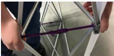
3B. Lock the arm into place by pushing the two sides of the frame together.