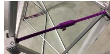
3. Line up the female arm to the frame hub (3A.) and push into place (3B.).