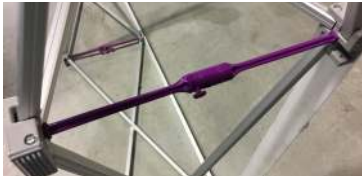
1. The unit starts together.