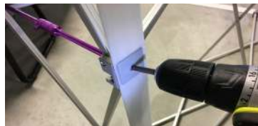
4. Secure the female arm by screwing the plate to the frame hub.