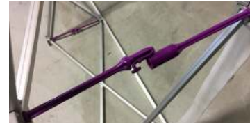
M1. Unbuckle the male and female arms then gently tilt either arm up or down.