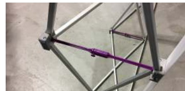
5. The unit is assembled.