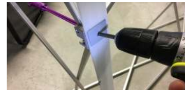
F1. Unscrew the plate and female arm from the frame hub.