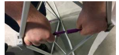
3A. Make contact when lining up the female arm and the frame hub for easier connection.