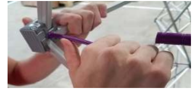
M2. Loosen the male arm by wiggling side to side and remove by pulling to one side.