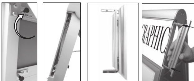
Inside view Secondary Graphic Side view Secondary Graphic Right side Frame Channel Installing Secondary Graphic

For the Secondary Graphic (2), gently pull the two black knobs located on the inside of the A-Frame. Turn knobs out and a quarter turn to the right. This allows you to remove the right side frame channel. Remove existing gray panel and slide your Secondary Graphic (2) in through the opening now created. Align the two corner keys with the slots and replace the frame channel. Turn black knobs until they lock into place.