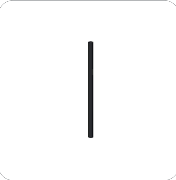
TOP POLE x1