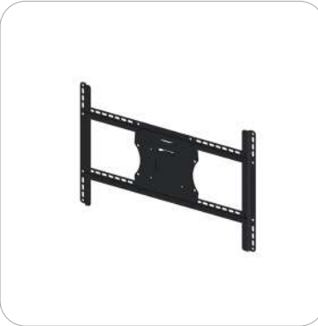
MONITOR MOUNT ASSEMBLY x1