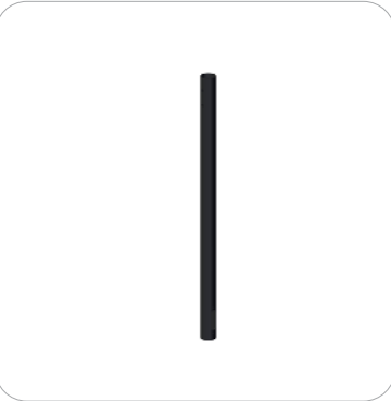
BOTTOM POLE x1